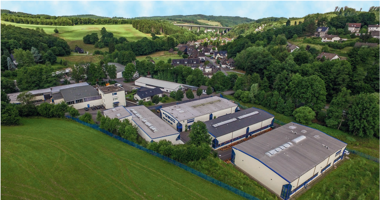
> Aerial view of the company premises in Reichshof

High-Quality valves for industrial applications and energy production.